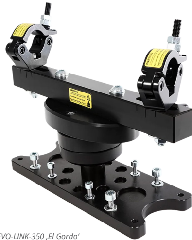
EVO-LINK-350 ,El Gordo'